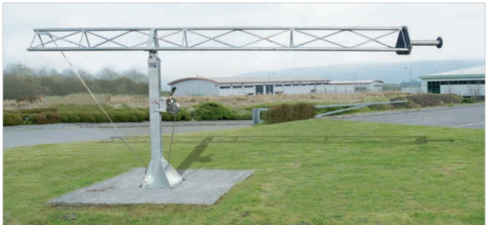
ACTI BP in tilted position